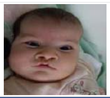
Figure 1: Showing bilateral cleft lip incomplete with strabismus.

A 3-month-old girl presented to the surgical consultation room with bilateral cleft lip incomplete. A girl weighing 4205 g, was born at term after an uneventful pregnancy with a birth weight of 2500 g. There was no family history. On examination, a congenital, linear, erythematous cutaneous anomaly on the left side of her neck was highlighted with ocular anomalies (strabismus and the eyes are widely spaced) and a broad nose with a flattened tip. The examination of the other systems was unremarkable. In front of the association of these different anomalies BOFS was suspected but molecular diagnosis has not been made. The child benefited surgery to correct cleft lip with tennisson procedure with a good postoperative result.