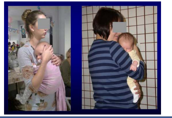
Figure 3: Nursing. On both Figures (A) and (B) - proper therapy of the wry neck left sided – in Latin – "torticollis sinister". The permanent position in rotation of the head to the left side is the best and only one proper method of therapy of the wry neck. Hips in abduction – prophylaxis of dysplasia.