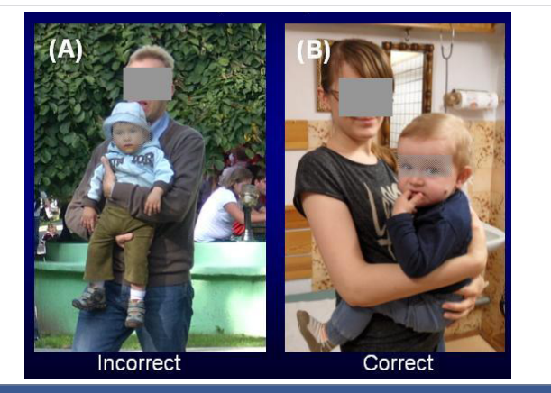
Figure 2: Nursing. (A) Incorrect carrying of the child – mistaken of recommendation in Poland and in other countries in Europe by some not proper educated doctors and physiotherapists. (B) Proper nursing of child – prophylaxis of dysplasia of the hips. Such carrying should be continued one year or longer.