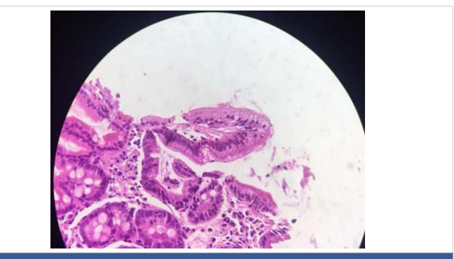
Figure 2: Hematoxylibe eosin; x 20 intestinal villosity with microvacuolar aspect of the apical pole of the enterocytes and a non visible brush border.

Previous studies in patients with MVID have shown a high stool volume (150-300 ml/kg/day) with a remarkably high sodium content (about 100 mmol/L) [6]. The diarrhoea present during MVID is considered to be non-osmotic in nature (i.e. the difference between faecal ions is less than 100