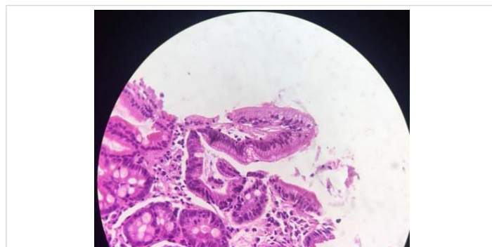
Figure 2: Hematoxyline eosin; x 20 intestinal villosity with microvacuolar aspect of the apical pole of the enterocytes and a non visible brush border.

Previous studies in patients with MVID have shown a high stool volume (150-300 ml/kg/day) with a remarkably high sodium content (about 100 mmol/L) [6]. The diarrhoea present during MVID is considered to be non-osmotic in nature (i.e. the difference between faecal ions is less than 100