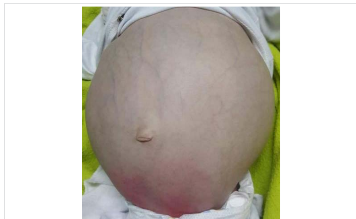
Figure 1: Picture of our patient shows the enormous abdominal distension.

The fecal elastase dosage is reduced to: 26 ug/g of stool: showed an exocrine pancreatic insufficiency, so the infant was supplemented with pancreatic extract, however immunoreactive trypsin is normal.