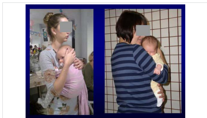
Figure 3: Nursing. On both Figures (A) and (B) - proper therapy of the wry neck left sided – in Latin – "torticollis sinister". The permanent position in rotation of the head to the left side is the best and only one proper method of therapy of the wry neck. Hips in abduction – prophylaxis of dysplasia.