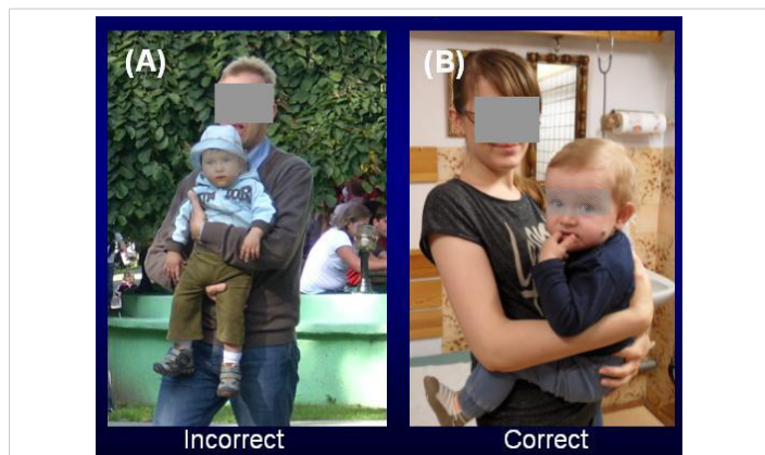
Figure 2: Nursing. (A) Incorrect carrying of the child – mistaken of recommendation in Poland and in other countries in Europe by some not proper educated doctors and physiotherapists. (B) Proper nursing of child – prophylaxis of dysplasia of the hips. Such carrying should be continued one year or longer.